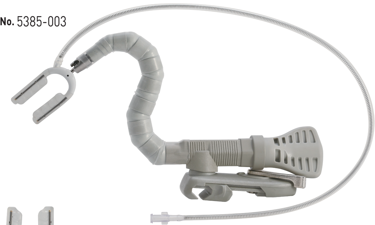
HUMETRON STABILIZER 1.0